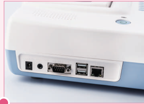
USB port for data export