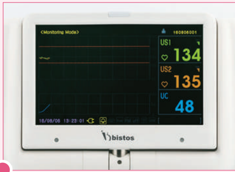
BT-350 LCD Graphic mode