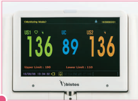
BT-350 LCD Number mode