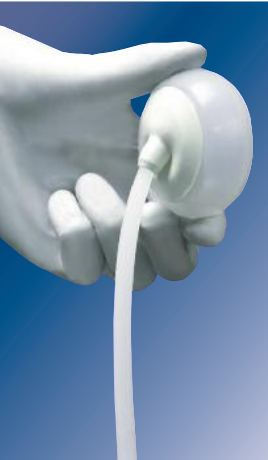
New low-profile M-Style cup