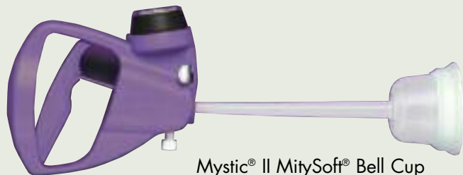
Mystic® II MitySoft® Bell Cup 10058