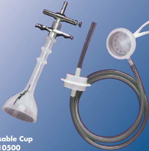
Reusable Cup 10500