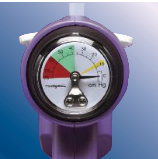
Easy-to-read color-coded gauge