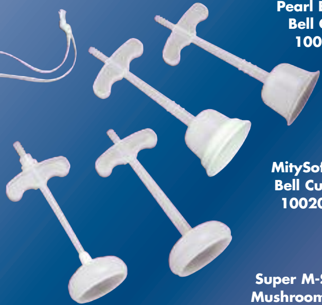
Pearl Edge® Bell Cup 10004